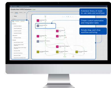
Figure 2. Accelerate delivery of applications and infrastructure using a drag-and-drop automation and workflow designer